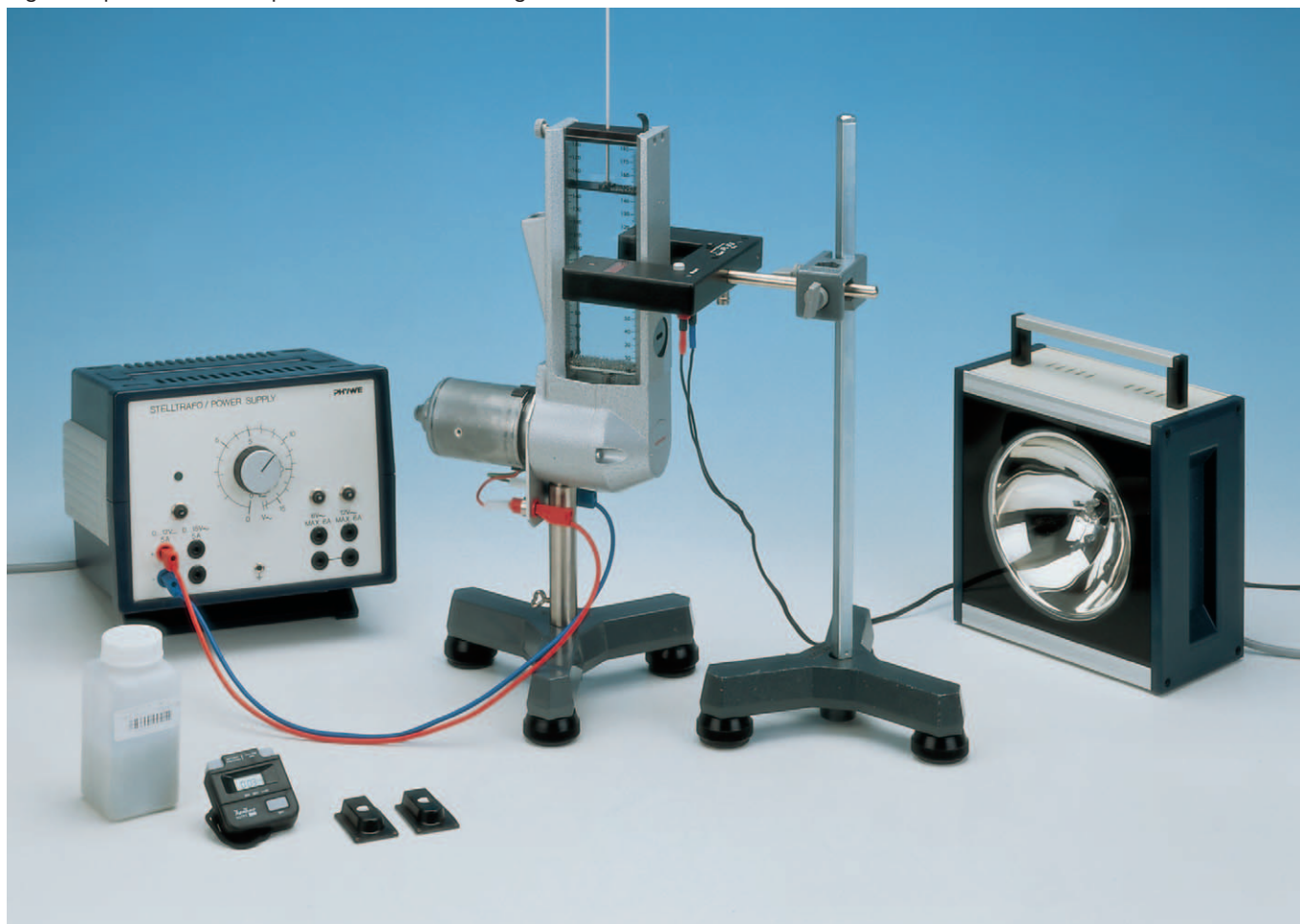
Fig. 1: Experimental set-up for the barometric height formula.

The experimental set up is as shown in Fig. 1. The kinetic theory apparatus is filled with about 400 steel balls. (Approximately one layer of balls) The plunger is set to maximum volume. The speed of rotation – and hence the vibrational frequency – is adjusted by means of the power supply and measured with the stroboscope (stationary image of the vibrating plate). The maximum speed of rotation of 3000 \text{ min}^{-1} should not be exceeded. Using the forked light barrier with counter, the number of balls which pass the beam of light in the prescribed time is counted (an area of approx. 0.4 \text{ mm}^2 is used). Immediately above the vibration plate the probability of several balls passing through is very high. It is therefore recommended that the measurements are started at a height of only about 3 cm above the vibration plate.